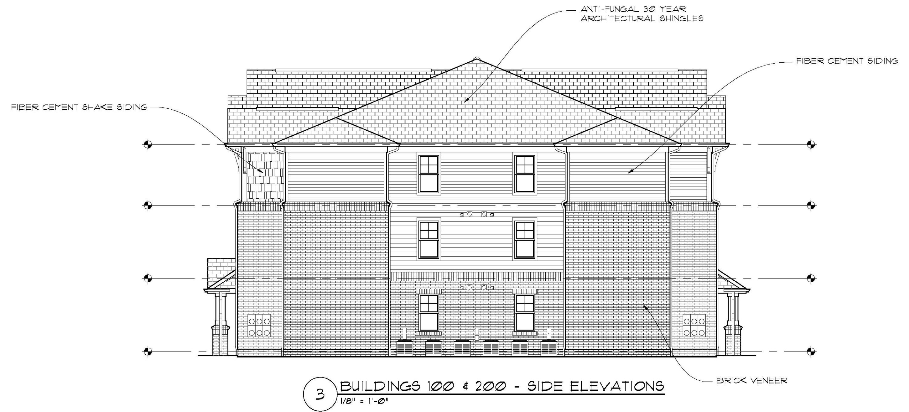
3 BUILDINGS 100 & 200 - SIDE ELEVATIONS 1/8" = 1'-0"