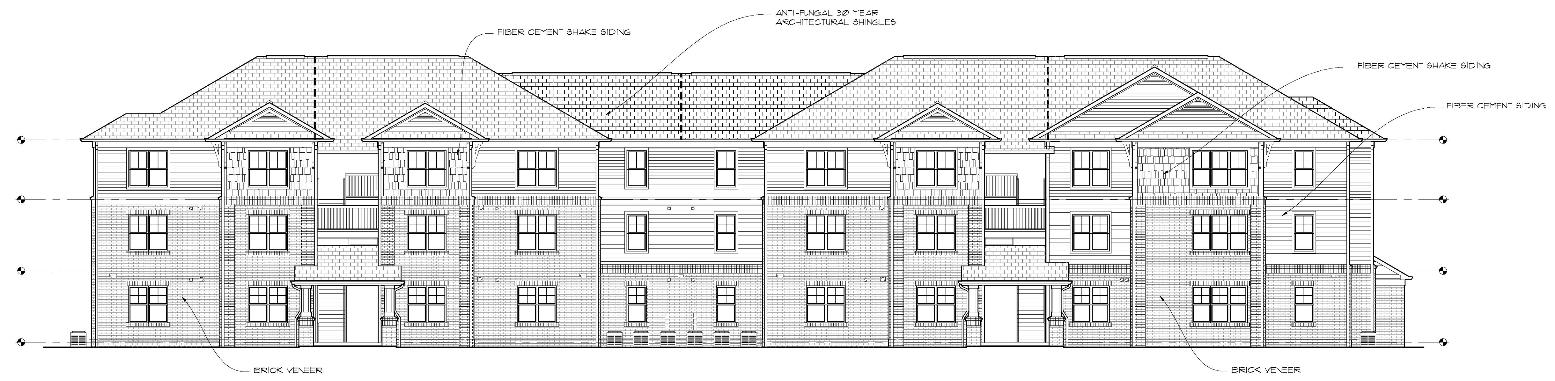
2 BUILDINGS 100 & 200 - REAR ELEVATIONS 1/8" = 1'-0"