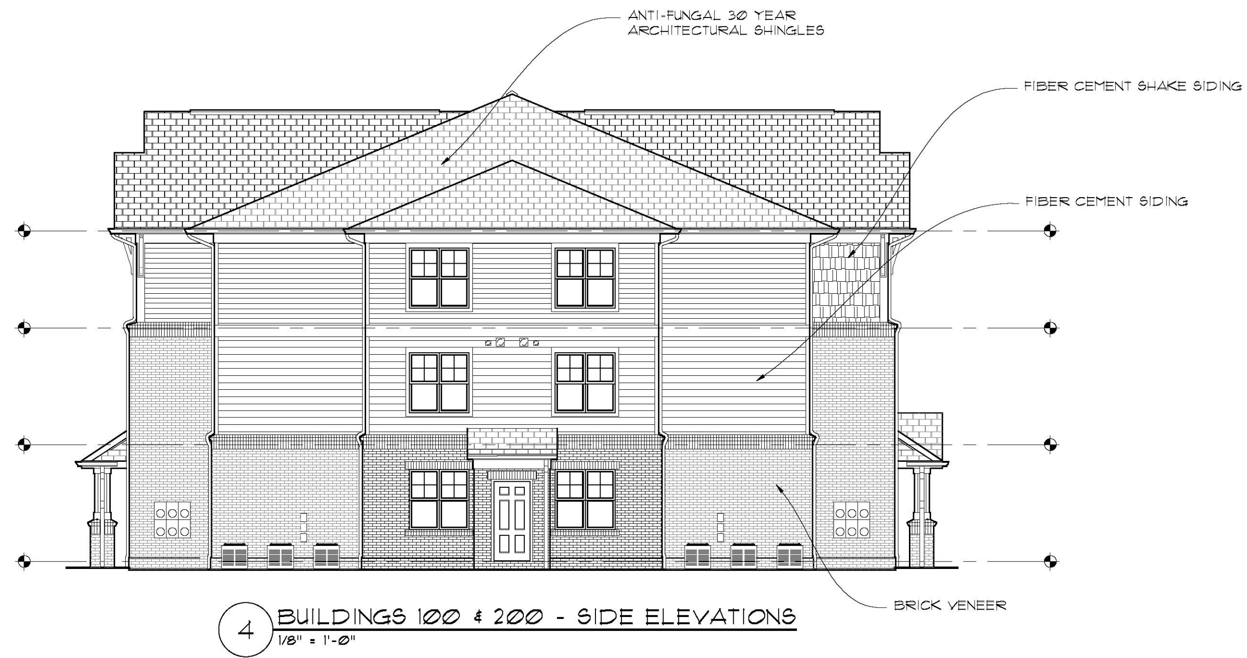
4 BUILDINGS 100 & 200 - SIDE ELEVATIONS 1/8" = 1'-0"

PLOTTED: 5/17/2020 8:49:52 AM - DRAWING: P:\SCANTLAND\2019-048 WILSON, NC\PRELIM 2020\SHEETS\A31.DWG - PLOTTED BY: MICHAEL LEE - COPYRIGHT 2020