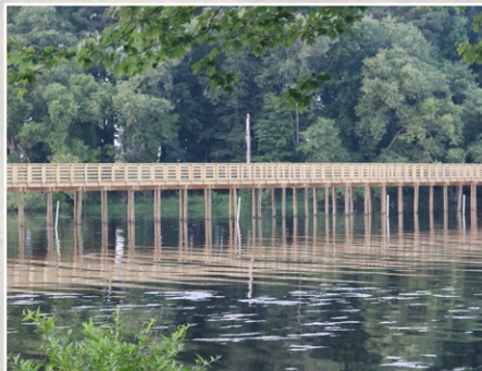
Completion of 1,000 foot walking bridge