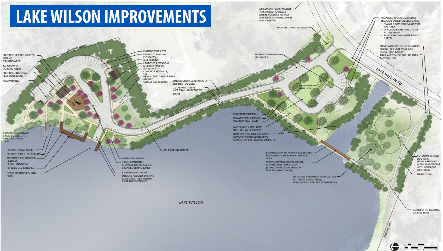
LAKE WILSON PARK • WILSON, NC • CONCEPT PLAN PN 2018065 | 10.29.2018 | CITY OF WILSON