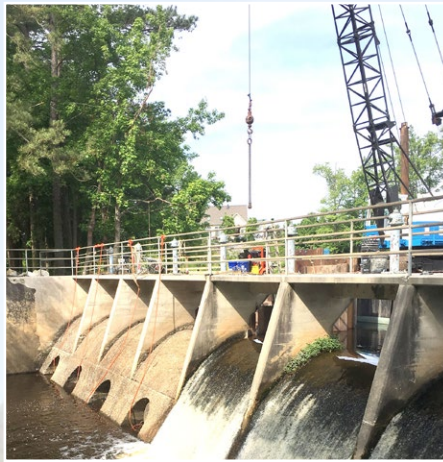
Renovation and repair of dam

Lake Wilson has been around for a long time. It has been used for many different purposes throughout its history, such as a sawmill and grain mill. Since around 1961, its primary use is for impoundment of our drinking water supply. This is also when the present day dam was constructed. At almost 60 years old, the dam is in need of some renovations and repairs. It is still structurally sound, but the control gates are showing their age. The present work will replace the gates and allow for some concrete repairs. Along with this work are some major upgrades to the Lake's surroundings in the recreational sense. The new 1,000-foot walking bridge is complete, allowing a 2.25 mile circle around the lake. New ADA compliant parking, kayak launch, and bathroom facility are a sample of what is to come. Improvements to the boat launch, docks, and overall parking are also planned. Please visit www.wilsonnc.org to see all of the great improvements planned for Lake Wilson Park.