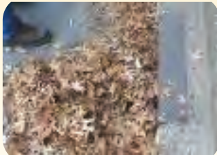
...leaves blocking storm drains.